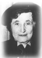
ט"ו סיון תרפ"ז (1927)