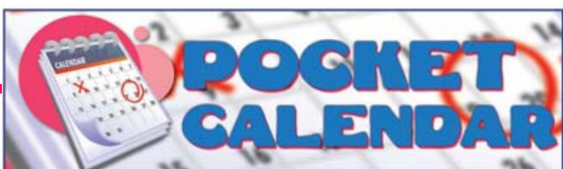
י"ג סיון תר"ס (1900)

(Adapted from 'The Book of Our Heritage')