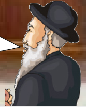
PLAINTIFF—AGUDAS CHASIDEI CHABAD

THE LIBRARY BELONGS TO AGUDAS CHASIDEI CHABAD. IT'S THE FRIERDIKE'S LIBRARY BECAUSE HE IS THE HEAD OF CHABAD. NO INDIVIDUAL CAN TOUCH THE BOOKS THERE.