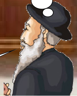
PLAINTIFF—AGUDAS CHASIDEI CHABAD

THE JUDGE ANNOUNCED HIS RULING ON ה' טבת. SINCE THEN, ה' טבת HAS BEEN A GREAT YOM TOV FOR CHASSIDIM. THE REBBE STRONGLY ENCOURAGED THE CHASSIDIM TO TAKE A LESSON FROM ה' טבת BY BUYING SEFORIM, HONORING SEFORIM AND MOST IMPORTANTLY, LEARNING SEFORIM! SO GO TO SHLUCHIMKIDS.ORG WHERE YOU'LL FIND SOME REALLY FUN GAMES AND ACTIVITIES ALL ABOUT SEFORIM!